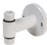
Double Threaded Wall Mount