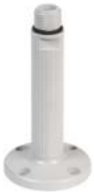
Footring with Extension