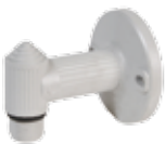
Threaded Wall Mount